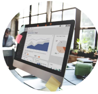
Fees & Marketing