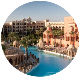
Travel & Expenses