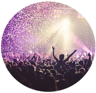
Tours & Entertainment