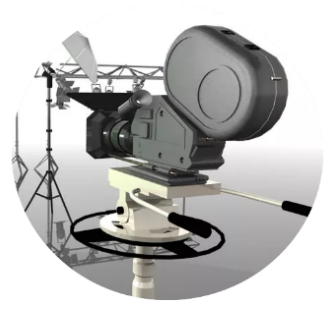
TV & Movie Production